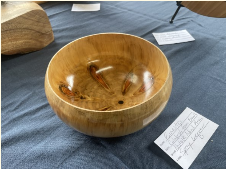
Name: ERICASTO Item: CUPBOULDER from Bowl Wood: ALABAMA Black Pine Finish: Spray Lacquer