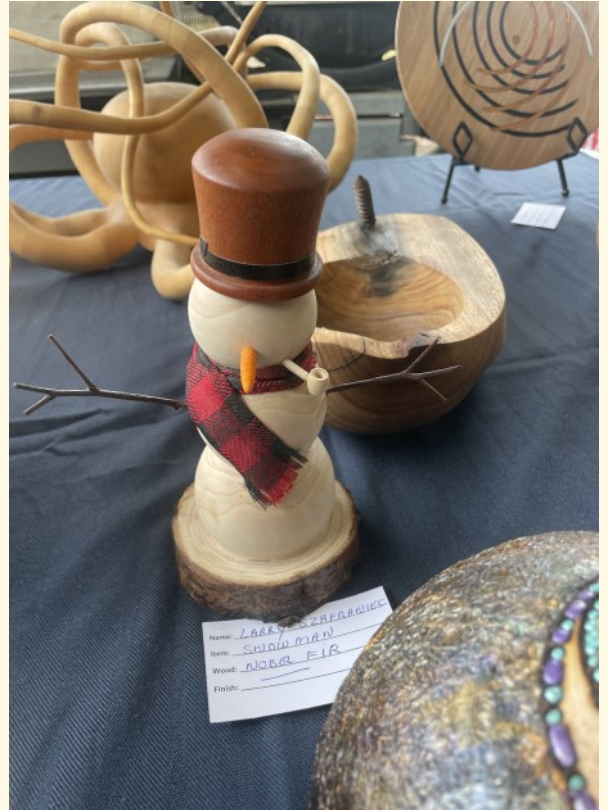
Name: LARRY ZAFRANOS Item: SNOWMAN Wood: NOBIL FIR Finish: