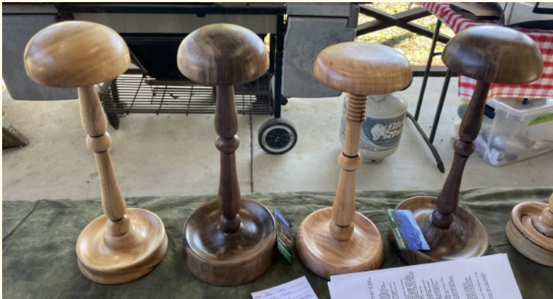
Turning Diagram and dimensions for the wig stands (L) in Tips & Techniques of our Members Only page of our Website.