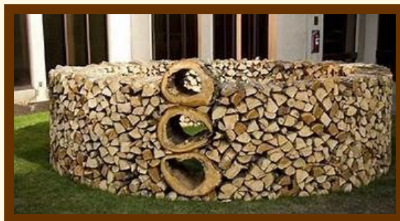
Stacking Wood Ideas

Breaking News: I will be at the Wood Resource lot at Nottingham this Saturday (13 April) from 1100-1300ish with some newly received WALNUT. Small pieces and large pieces. Burlish colored blanks and lots of swirly grain walnut bowls and box material. Don't miss this opportunity to obtain some of this gorgeous WALNUT wood. See you then.