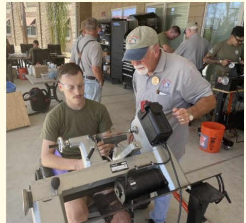
Pictures above from Wounded Warrior Barracks @ Camp Pendleton and project work beyond pens. Some great work by these Warriors with assistance from the TAV team members.