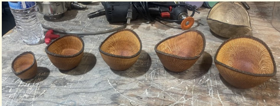
Jeff Neff's displayed demonstration pieces.