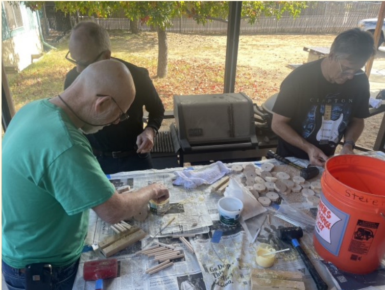
Top Blank preparation continues.

Thanks to SDWT members who assisted at our last Drop-In Sat (Nov 23rd) in prepping Top Blanks.